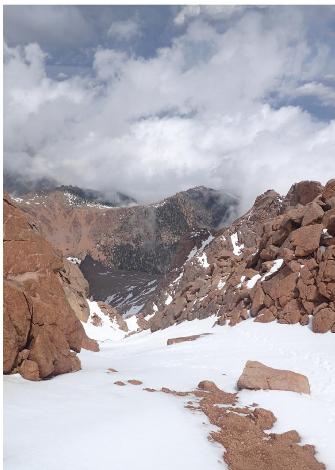
Entrance to Railroad couloir on Pike's Peak

overview of some of the best skiing Colorado has to offer, from right here in our backyard on Pikes Peak to high summits deep within the Rocky Mountains. There's something for every skier out there so get ready to expand your horizons this spring!