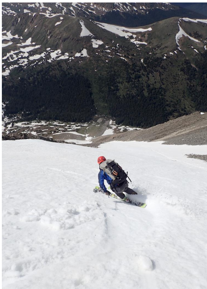
Descending the NW couloir on Torrey's Peak

Have you always wanted to extend your ski season beyond early spring when most of the lift areas have closed?