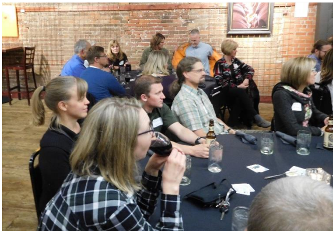
PPG Annual Dinner, November 19, 2016