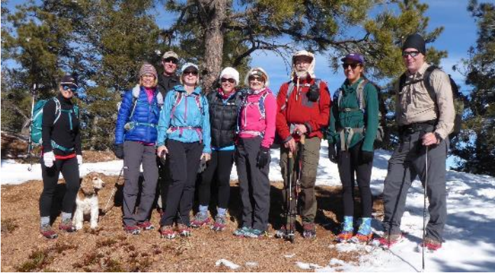
Red Rock Canyon Open Space through Sect 16 hike