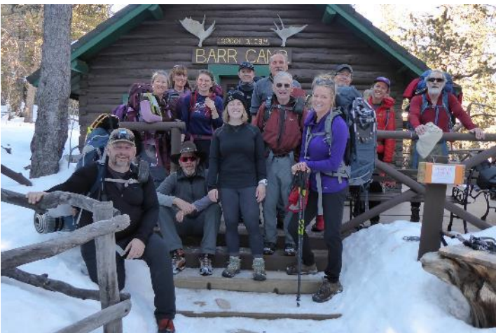
Barr Camp and Pikes Peak hike