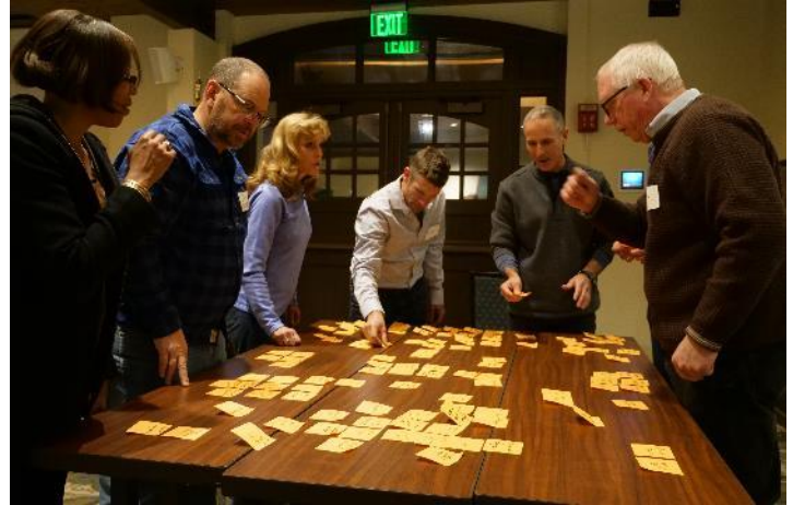
CMC Strategic Planning Meeting