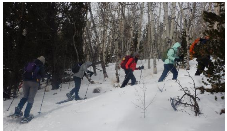
Kenosha Pass snowshoe hike