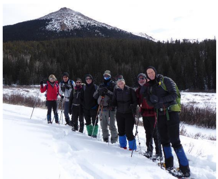
Putney Gulch snowshoe hike