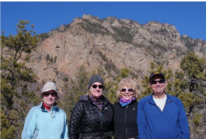
Cheyenne Mountain State Park hike