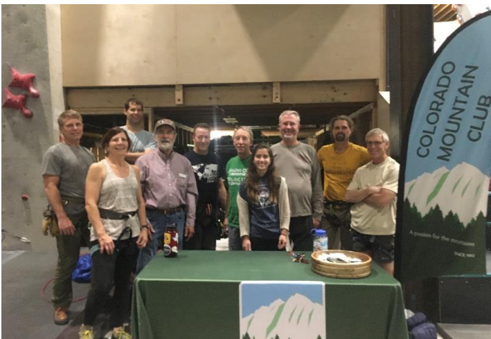
CMC Climb Nights