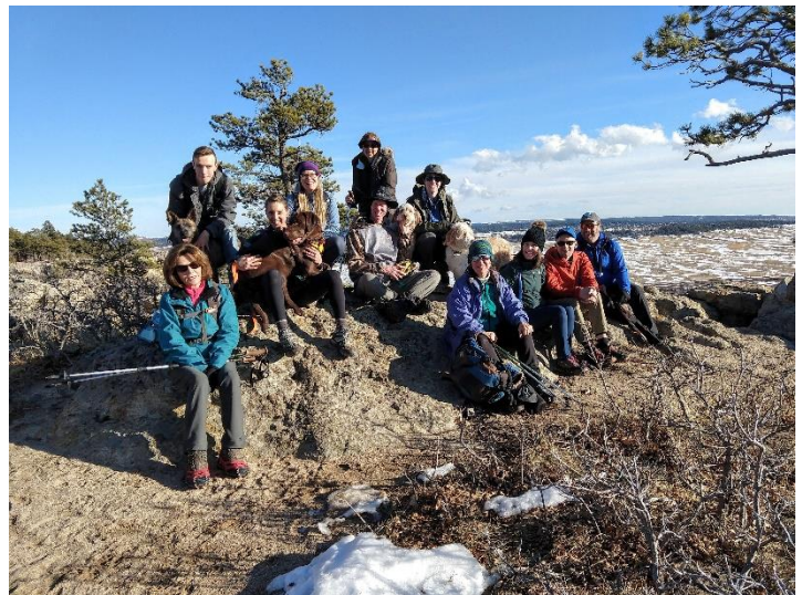
7 Bridges – Buckhorn Trails Hike