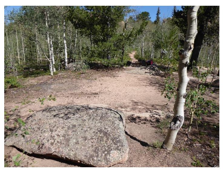
There will be more of these BPX Backpack Surveys this year.